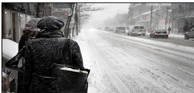
This is you in February