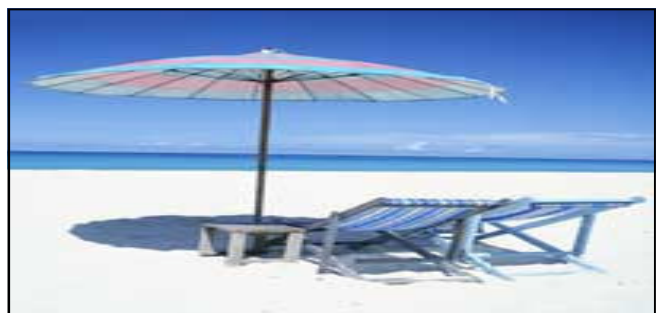
This chair waits for you in Punta Cana